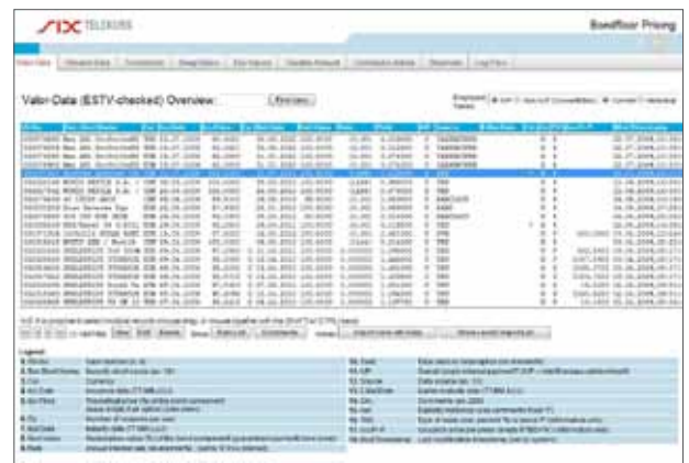
Bondfloor Pricing Service platform: clear presentation of instruments.

The Bondfloor Pricing Service start page gives you an overview of all key figures and reference data for the appropriate financial instruments. The tax values are calculated using the key data and swap rates displayed.